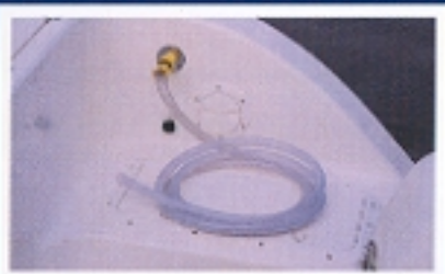
The 210, 230, 257 are all equipped with a raw water wash down system.