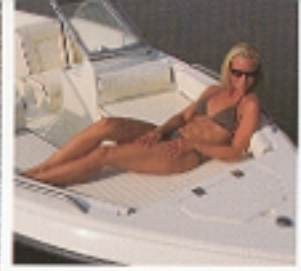
Relax on the bow cushions and catch some rays.