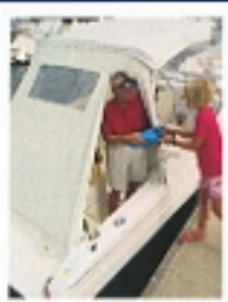
Full canvas is available for the 204 Cuddy Fish.