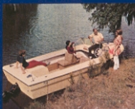
Bringing families together for over 40 years.