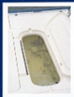
Two flush mounted live wells are standard equipment on the 200 Flats Fox.