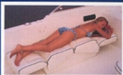
The fold down lounge seats are standard equipment on the 185 Dual Console.