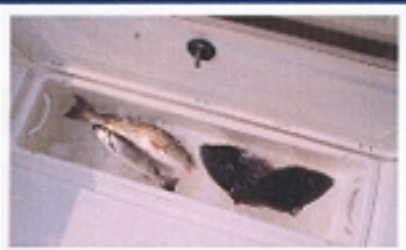
The 257 Walk Around and Center Console are equipped with a fish box.