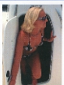
The 257 CC has a standard head.