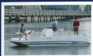
The 201 comes as a fishing platform in the DF version or as a family party boat in the CR model (pictured below).