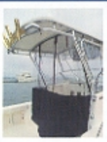
Full canvas is optional on the 210, 230 & 257 WA with hard top.