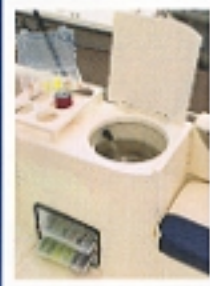
The 221 DF's Bait Station.