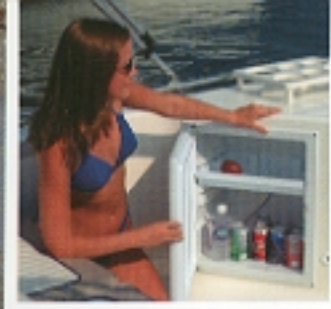
The 181 comes equipped with a handy ice box.