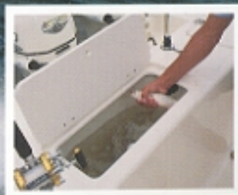
The 210 comes equipped with a live bait well.