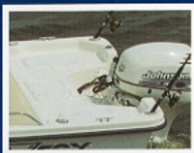
The 195 Bay Fisher has a large rear casting platform.