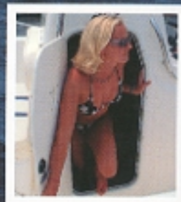
The 257 CC is equipped with a head in the console as a standard feature.