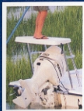
The 180 Flats Fox comes equipped with an optional poling platform.