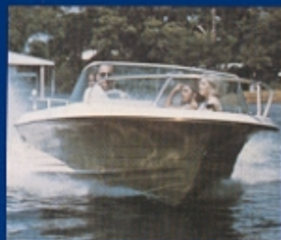
Efficient hull designs are a Sea Fox heritage.