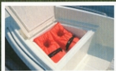
Convenient storage is available in the forward compartment.