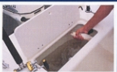
Most Sea Fox boats come with live bait wells.