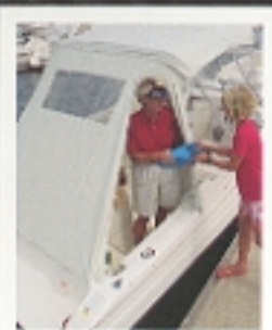
The optional full canvas is a welcome addition in foul weather.